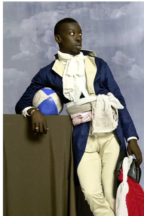
Project Diaspora: Jean-Baptiste Belley